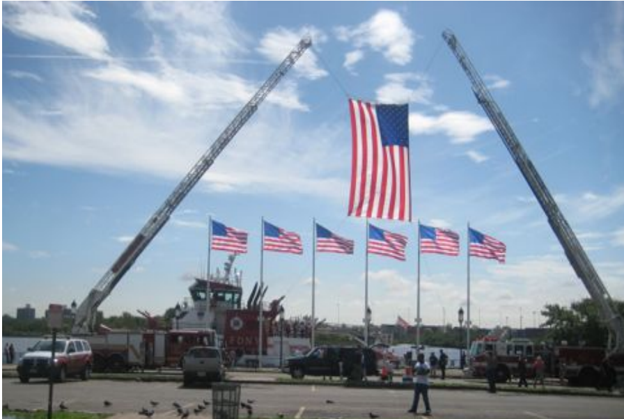
(Above) Ladder companies and a flag display greet NYC fireboat Three Four Three as it docked to discharge firefighters riding a 343 mile bike fundraising marathon. The number 343 is symbolic as it is the number of firefighters lost at the World Trade Center on 9-11-01. The new fireboat was dedicated in their honor.