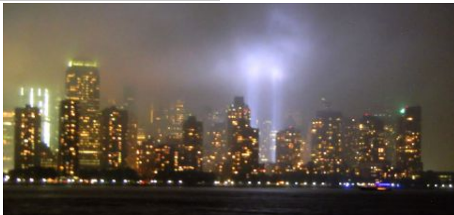
The lower Manhattan skyline, as seen from the deck of the dinner cruise yacht. Being a cloudy and rainy night, the full effect of the twin beams shining from the site of the collapsed World Trade Center loses some clarity, but is impressive nevertheless.

Following dinner on our own, the 2012 convention preview for Toronto and the 2013 intro to Milwaukee's anniversary presentation were viewed. Toronto members introduced a nifty 50-50 fundraiser among atten-