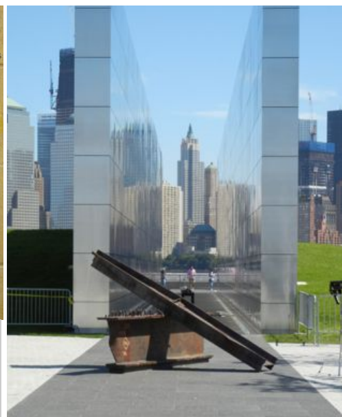
Empty Sky Memorial at Jersey City, dedicated September 10, 2011. It honors 746 New Jerseyans who died in the WTC disaster, with each name etched in stainless steel in 4-inch-high letters. Granite walkway dividing the towers face on a line to the Trade Center site in Manhattan. Steel beams from "Ground Zero" complete the memorial. IFBA members toured the site on 9/9/11.