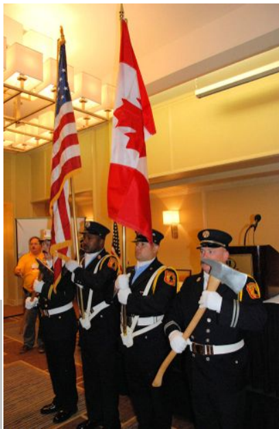
Jersey City Pipes and Drums present the colors at the 59th Annual IFBA Convention, Sept. 7, 2011.