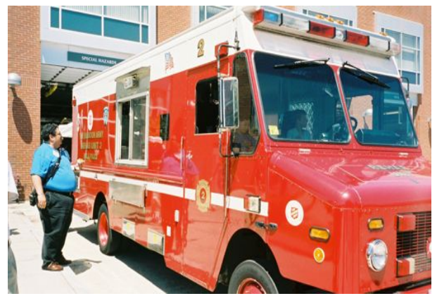
Region 2 VP Ira Rubin samples a hot dog served from Salvation Army Rehab Unit 2 at Providence HQ.