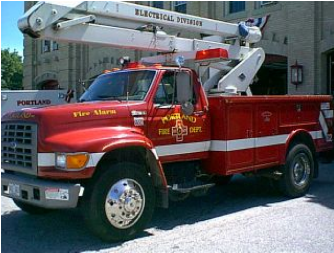
Rarely seen away from the East Coast is a fire vehicle designed for fire alarm repair. Portland, ME, and many other East Coast cities still use street boxes.