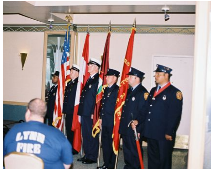
Color Guard at rest at Opening Ceremony, August 8, 2007.

Wednesday's opening session was well conducted, as the Pipe band opened the ceremony with stirring music. Introductions and welcomes were extended, and the 2007 program was under way.