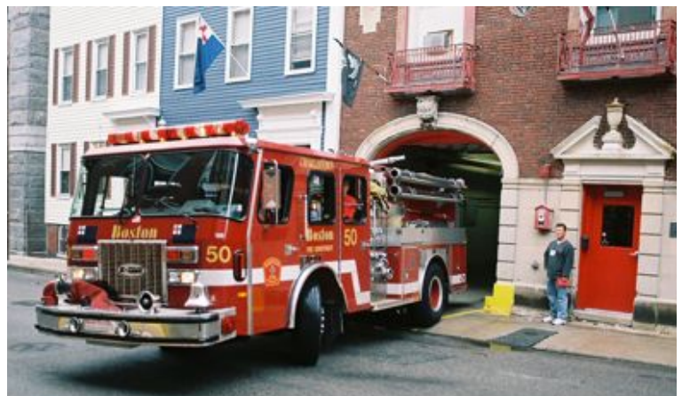
Brookline's Tower 1 awed most conventioners with its multi-positioning and tower extension (left). Boston Engine 50 on display outside its quarters at 34 Winthrop Street, Charlestown (above).

Arriving at Providence, RI headquarters, it was lunchtime and photo time with several canteens shown. A drive-by of city stations occurred as we left the area to return to Cambridge for the banquet and closing ceremonies.