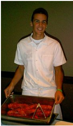
(Left) Our lobster chef proudly displays our lunch as guests gather for the lobster bake at Verrillo's Banquet Center.