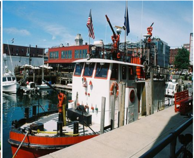
The Cavallaro , one of Portland FD's fireboats, awaits its next call on station at Portland Harbor.