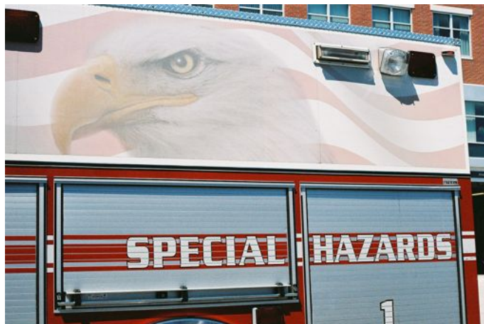
Eye-catching graphics were evident on several apparatus at the North Attleboro display.