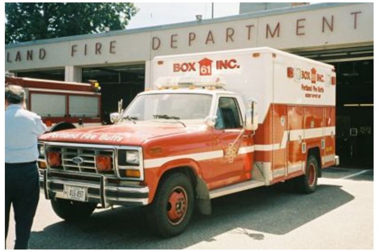
Box 61 Inc., Portland Fire Buffs' canteen, on display outside of its station.