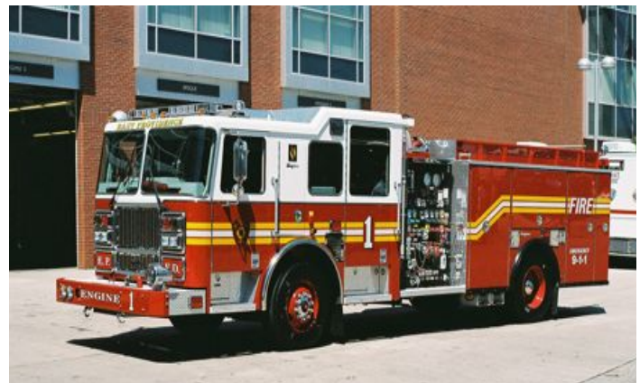
Providence FD proudly displayed their apparatus during the stop at their Public Safety Complex. Above, Engine 1 pauses for a moment for pictures.