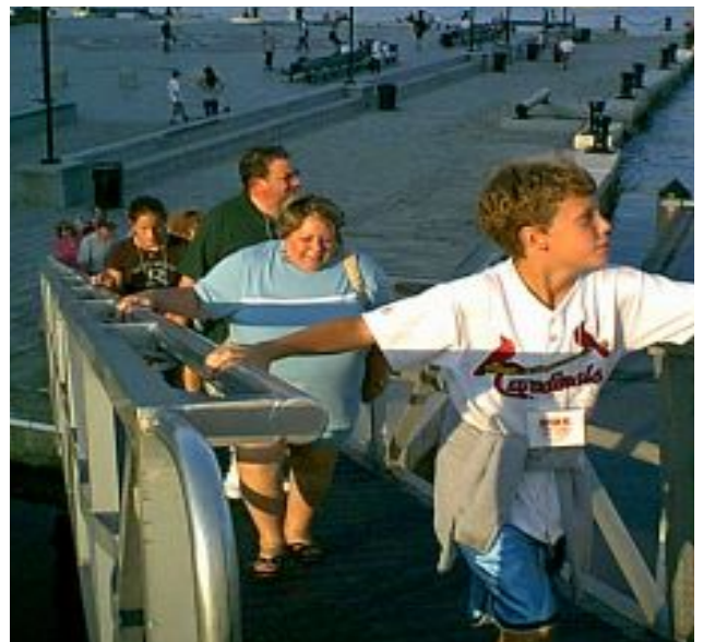
Convention guests happily board the Frederick L. Nolan Jr. in Boston Harbor for the twi-light cruise.