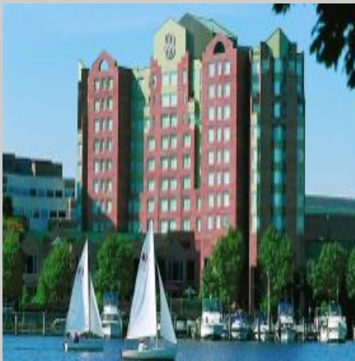
The Royal Sonesta, Boston, was the site of the 2007 IFBA Convention.