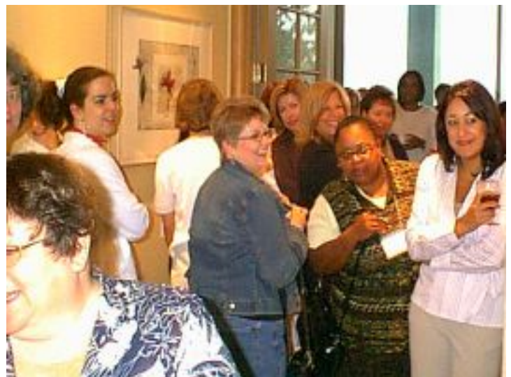
The Pipe Band attracted attention from a neighboring convention, much to their delight.