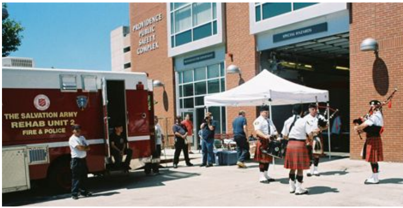
Saturday's lunch was provided by Providence Special Signal Fire Assn. at the Providence Public Safety Complex. Musical accompaniment was provided by the local pipe band.