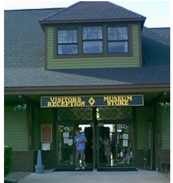
(Above and right) Next stop after lunch was the Seashore Trolley Museum, Kennebunkport, ME, home of the National Collection of American Streetcars. Founded in 1939, the museum exhibits and demonstrates electric trolleys and other public transportation.