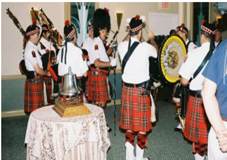
Pipe Band from Worcester Fire Brigade performs at the Opening Ceremony.