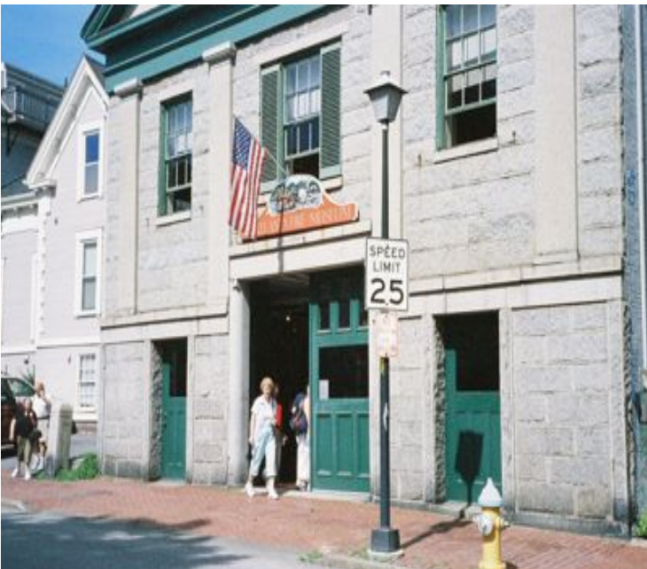
An early stop during our Portland, ME visit was at the Portland Fire Museum, 157 Spring Street. Original horse stalls and name tags were still in the building.

Thursday morning attendees were up and going early for the bus trip to Portland, Maine. Fireboats on the waterfront, a classic old firehouse museum and apparatus visits at city stations were followed by a lobster bake lunch. Afternoon activity took us to the Kennebunkport Trolley Museum. Tuesday evening allowed future convention cities Racine, WI and Washington, DC region to promote their program for 2008 and 2009.