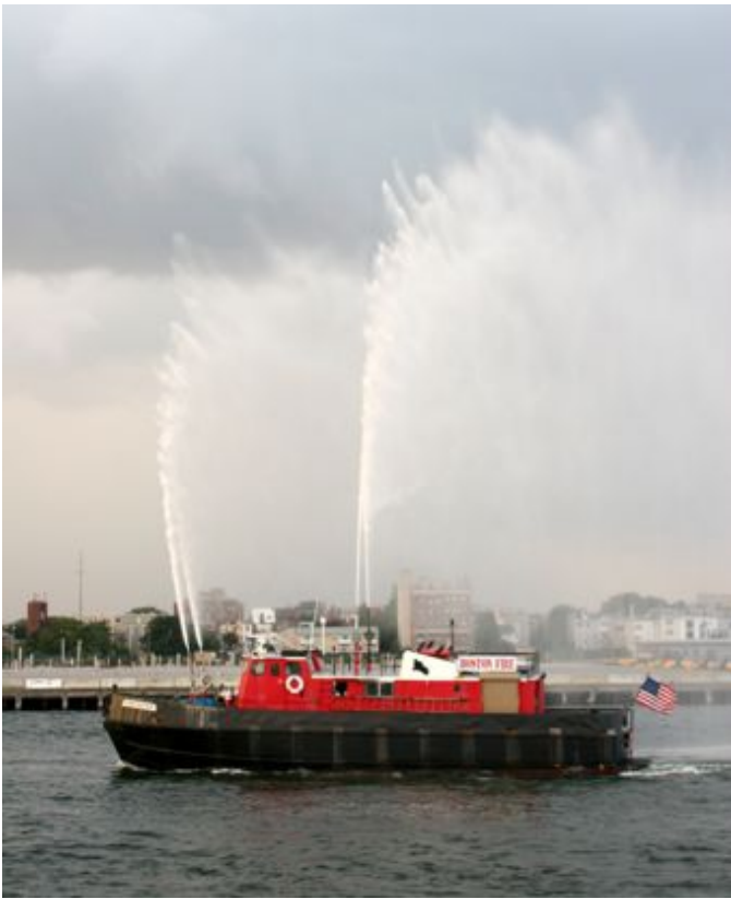
Boston FD's Marine 1, Firefighter , uses all 6000 gpm to welcome Firecon 07's evening cruise.