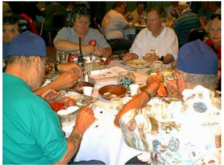
(Right) Guests enjoy a true East Coast delicacy, fresh lobster, along with cole slaw, red potatoes, clam chowder, and dessert.