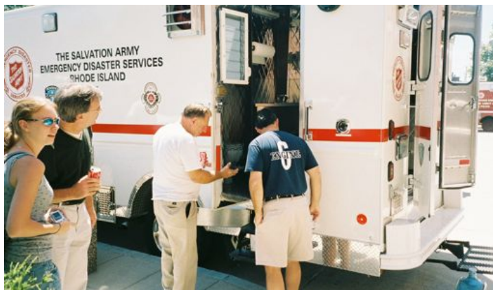
Convention goers marveled at the well-equipped Salvation Army Rehab Unit that included a stainless steel, fully functional restroom.