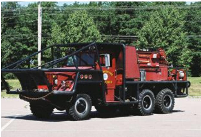
Rehoboth, MA FD "Breaker 2" is a brush truck mounted on a 2.5 ton Army truck for accessing brush fires .