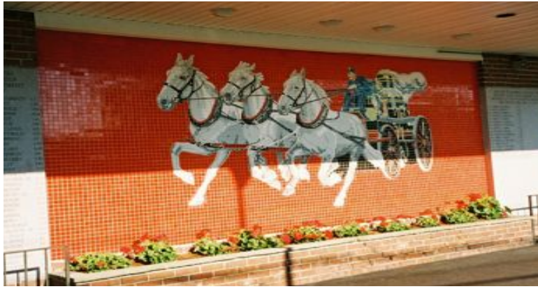
(Above) This stunning ceramic mural graces the entrance to Boston Firefighters' Local 718 Florian Hall, 55 Hallet Street. (Right) Boston FD Tower Ladder 3 dwarfs the fire alarm service bucket on display at Florian Hall.