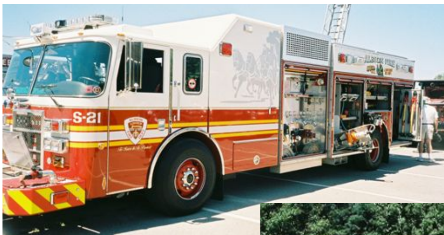
Apparatus displayed at North Attleboro included Ladder 1's tiller, Albion FD's Squad 21 (heavy rescue) complete with horse and steamer artwork. Below is the show stopper, a beautiful Ahrens Fox.