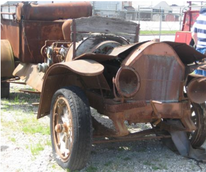
Those Wisconsin winters are really tough on the apparatus.

Thursday dawned with a good, hot breakfast in the conference area. Members then boarded buses