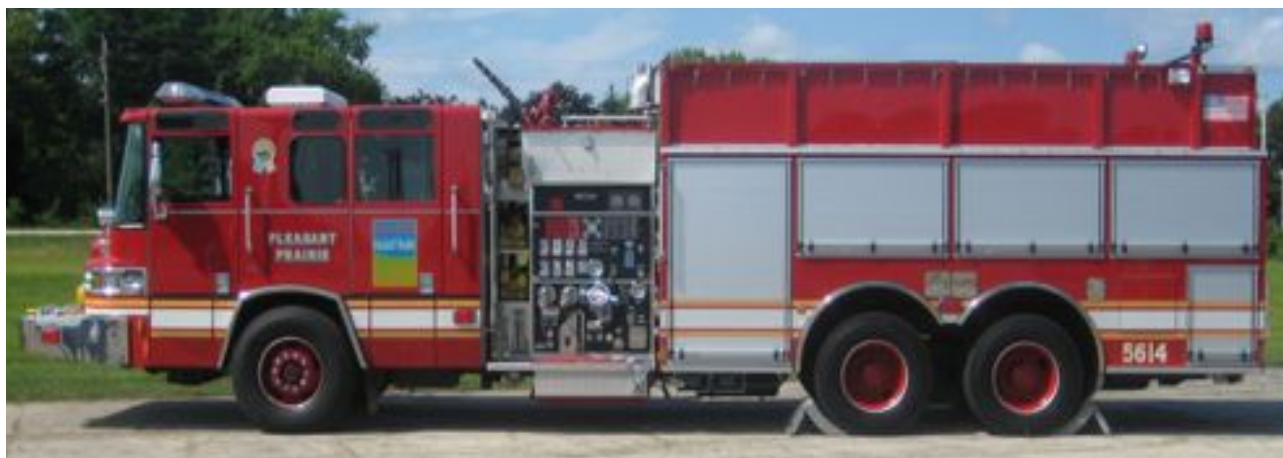
Pleasant Prairie, WI Fire Department has this 2005 Pierce Quantum capable of carrying 2000 gallon of water. "It's big!"

Congratulations and best wishes to our new IFBA president!