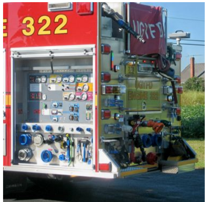
UGYFD Engine 322 has one of everything they'll ever need ... good salesman!