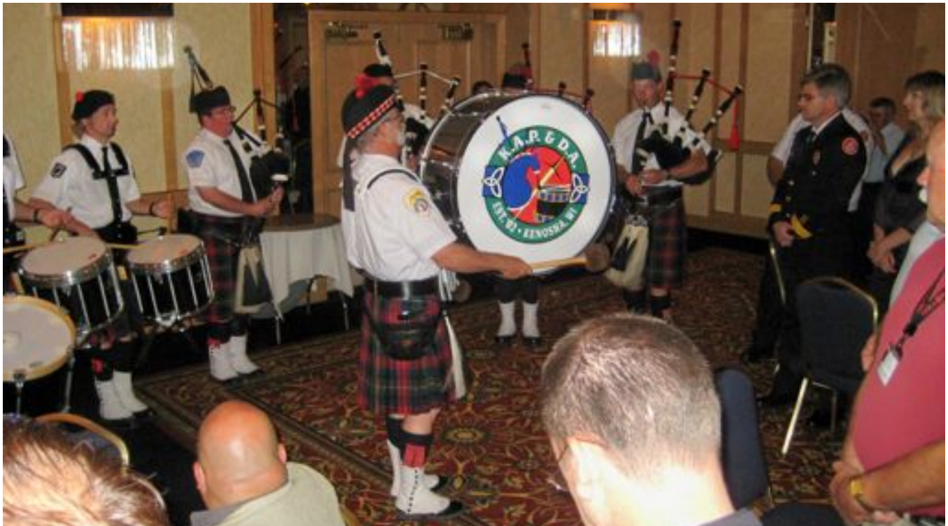
Members of the Kenosha Area Pipes and Drums Association perform at opening of the 2008 convention banquet.