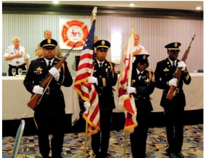
(Above) Members of the DC Fire Department Color Guard present the colors for the Pledge and United States and Canadian national anthems. (Below) The DC Fire Department Emerald Society Pipe and Drum band perform at the 57th Annual IFBA Opening Convention Ceremony.

vocation was administered by the Department Chaplain, Father Peter Weiss.