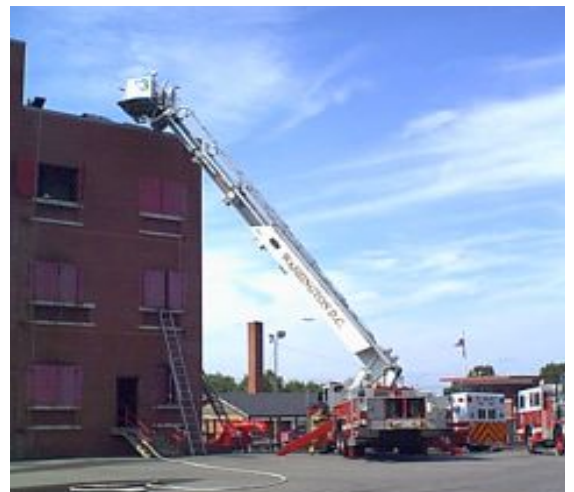
(Left and right) DC firefighters demonstrate the positioning of apparatus and personnel during a mock box alarm. Hose lines were stretched, the building was laddered, and firefighters conducted searches and fire containment as they would on a working incident. (Below right) A DC pumper is hooked up and ready to supply water as part of the box alarm demonstration.