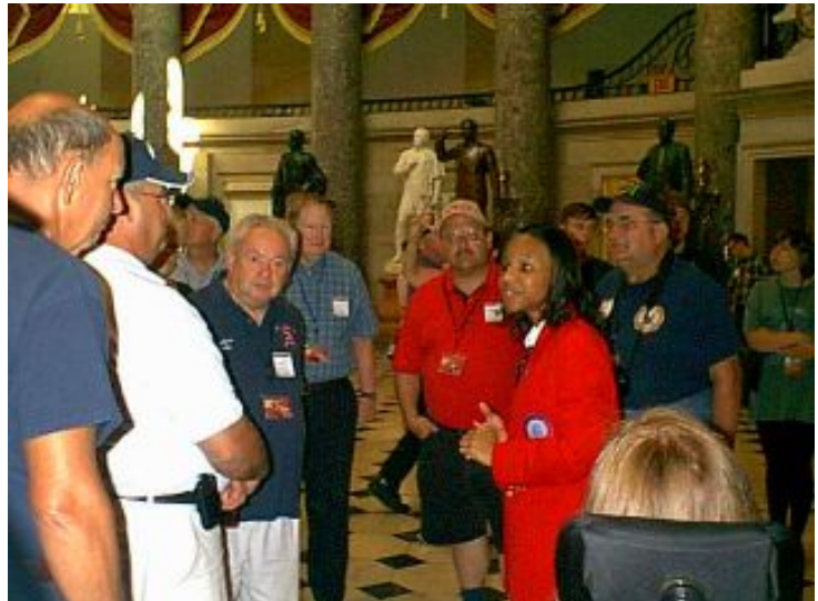
Convention attendees listen intently as they are given some of the history of the US Capital building. Later, upon leaving, many members had a long-distance observation of DC police and fire response to a suspicious package.

Friday began with a morning trip to the Capital