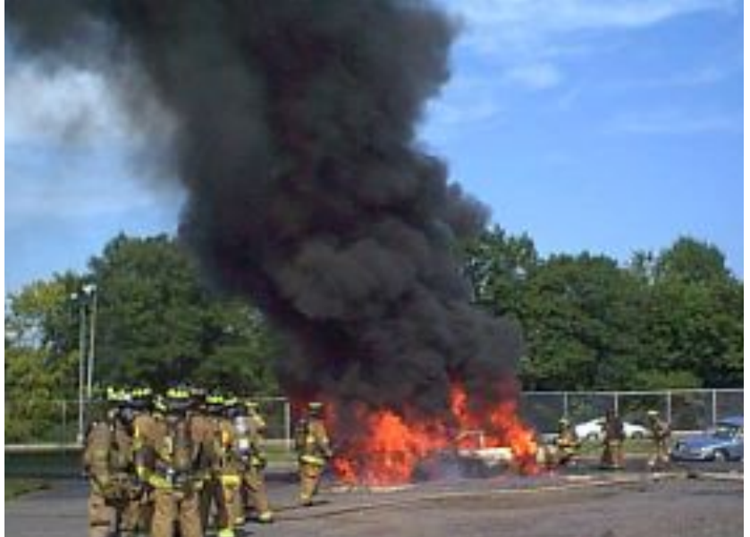
DC fire recruits wait for their turn to advance a hose line to extinguish a fully involved car fire. Several car drivers on the road bordering the training facility stopped to watch the training. The academy gets wrecked cars as needed for training. By the time they are returned to the scrap yard, all contaminants—oil, gas, and paint—are gone.