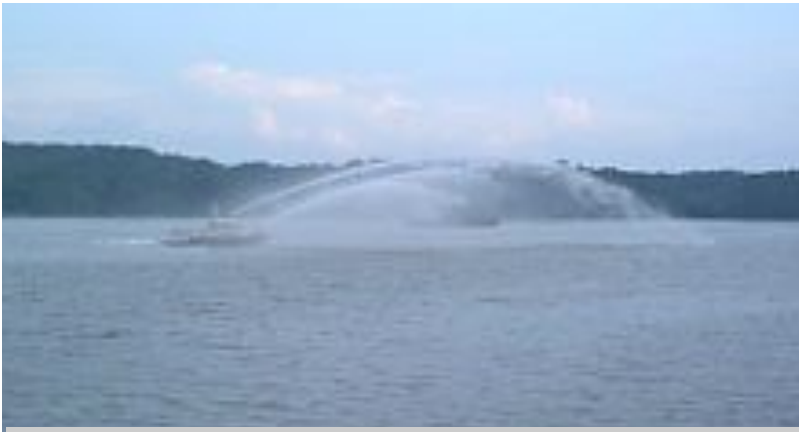
(Above and cover) Conventioneers were treated to a four fireboat salute during their Potomac River cruise.

building for a guided tour. After lunch, the group headed off to Alexandria Va. where they toured the Friendship Fire museum in Oldtown, as well as the city's oldest active fire station, 201, and the new station 209 under construction, which features apartments built above and designed to provide affordable housing for public safety personnel.