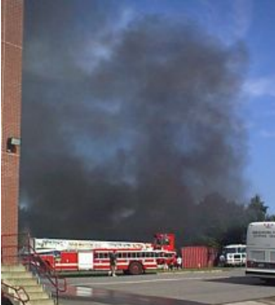
The first sight of dark smoke caught the interest of convention attendees. Upon further investigation, a class of actual recruits were being directed at the art of extinguishing a car fire.