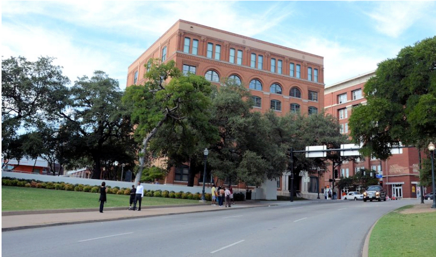
The Street past Dealy Plaza and the former Texas school book depository are shown above. X's on the present day street mark the position of President Kennedy's car at each shot.