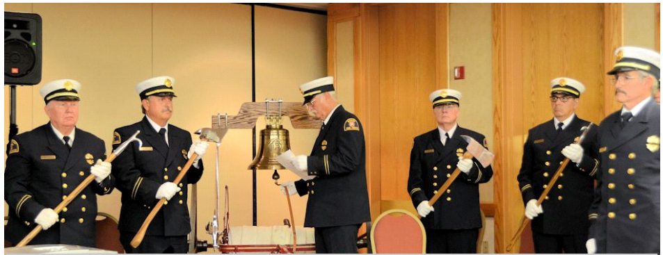
Dallas Retired Firefighters Last Alarm Honor Guard honor recently deceased IFBA members during the annual Reading of the Necrology.