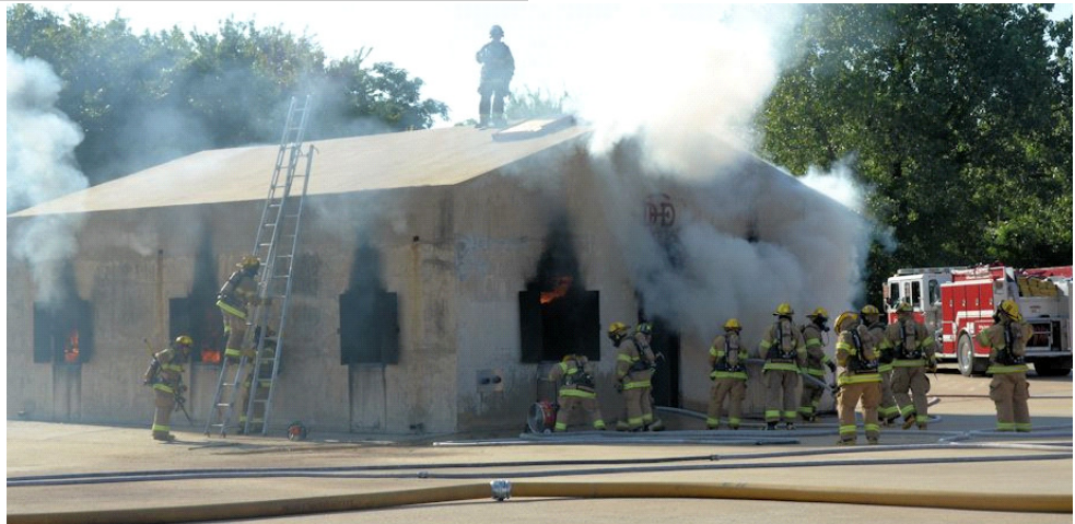
DFS recruits show their skills during a practice burn at the DFS Training Facility. Recruits gave up a day off in order to provide this demonstration to conventioners.