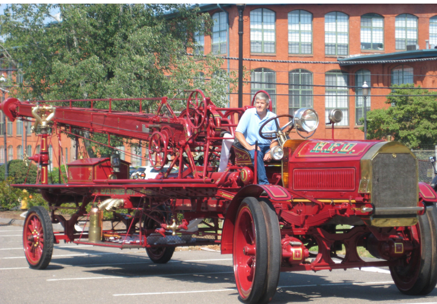
Hartford, CT Fire Dept Water tower at Manchester, CT Fire Museum