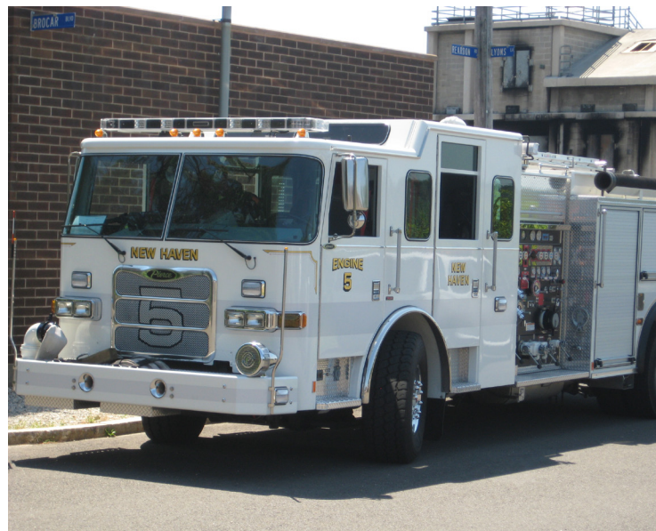
New haven CT Fire Dept. white engine