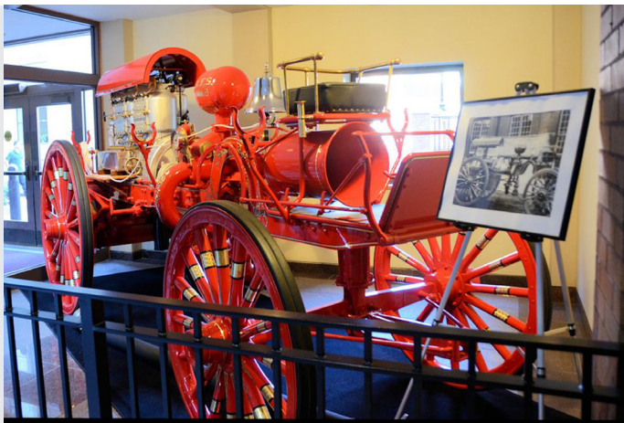
Westinghouse Fire apparatus, New Haven City Hall