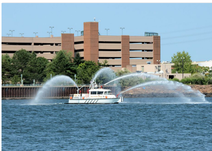
Marine 1, New Haven FD