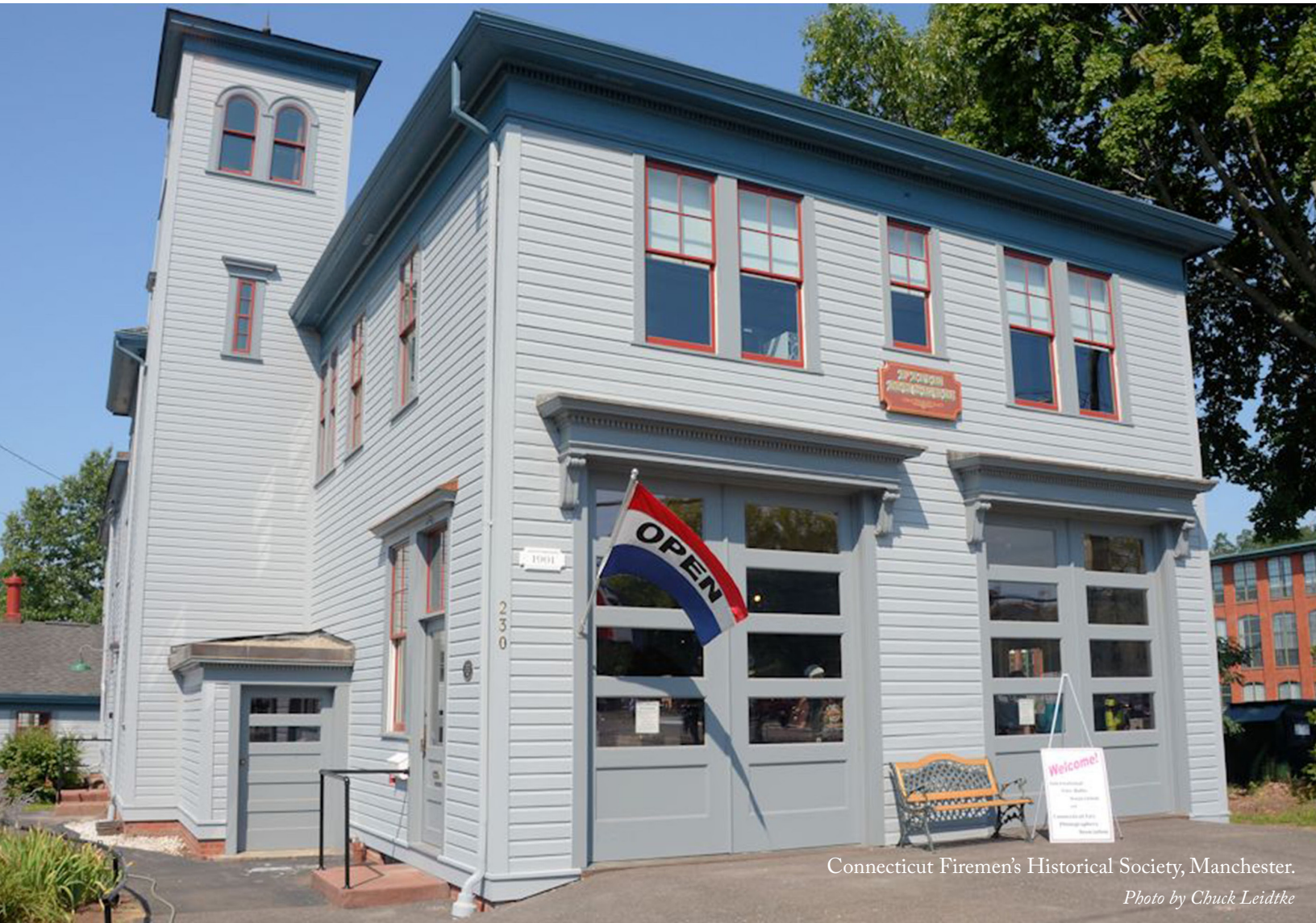
Connecticut Firemen's Historical Society, Manchester.